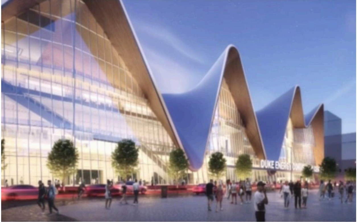
5 TH ST STREET V